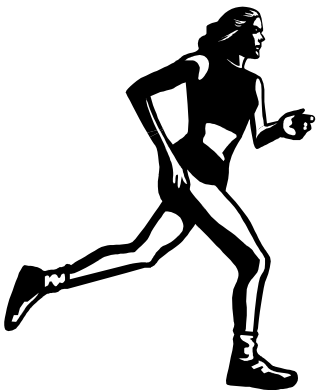
Race for Health

Family Planning Plus 4612 West Branch Highway Lewisburg, PA 17837